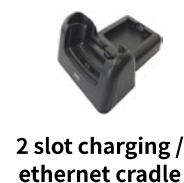
2 slot charging / ethernet cradle