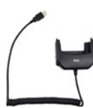
8 slot charging / ethernet cradle